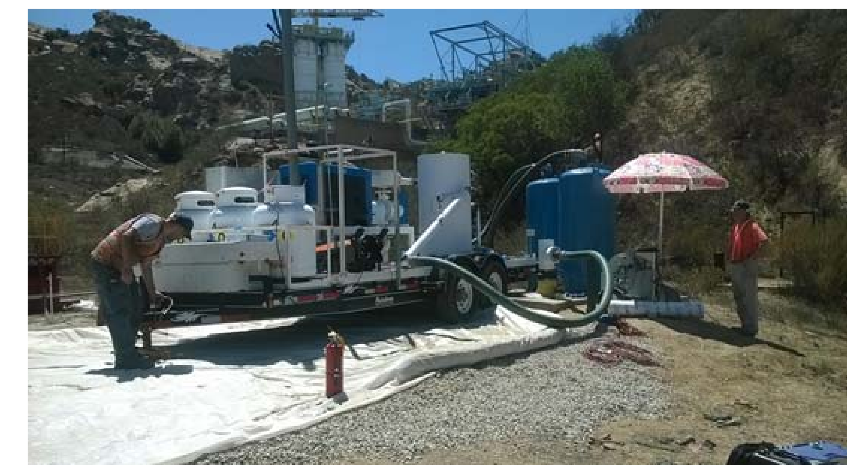
VAPOR EXTRACTION TO CLEAN UP VOCs